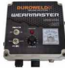
TM-MCB Main Control Box