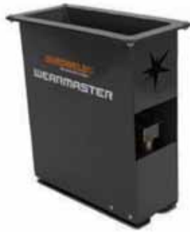
TM-HOPP Hopper / TM-VU Vibratory Feeder Unit