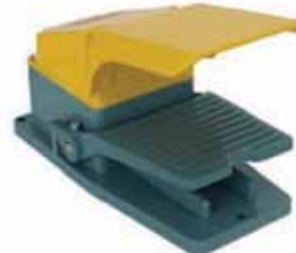
TM-FP Foot Pedal