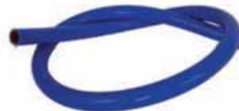
TM-TH Silicon Dropper Hose 16mm