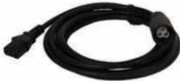
TM-IC Interconnecting Cable