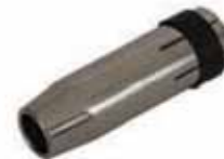
M-145-0080 Dispensing Nozzle