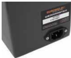
Power Inlet Socket / Serial Number